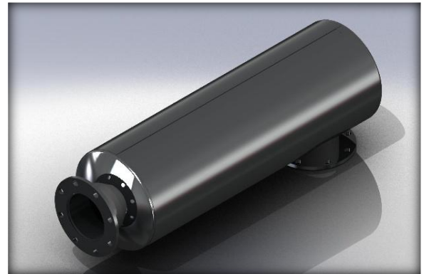
CSR-06 in 316 stainless