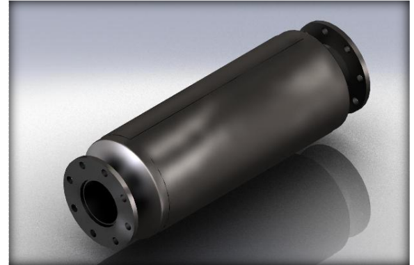
CSI-06 in 304 stainless