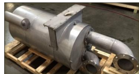
Combination DOC / Silencer / Spark Arrestor

Bergari Solutions, LLC 2605 160 th St. W., #109 Rosemount, MN 55068