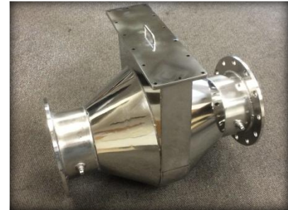
304 Stainless Steel DOC / 3-Way Housing