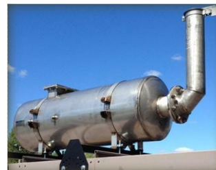
Integrated DOC / Silencer