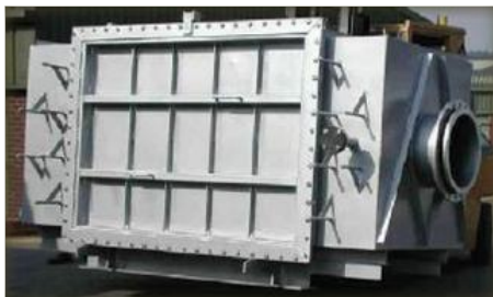
SCR Catalyst Housing