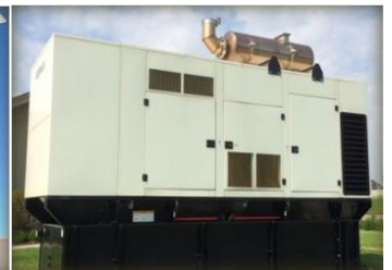
RICE/NESHAP DOC / Silencer